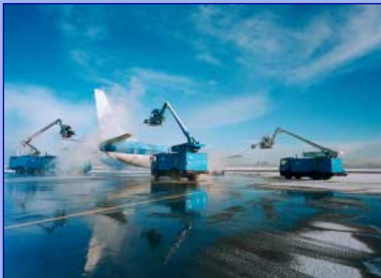
A de-icing operation by KLM at Amsterdam's Schiphol Airport. KLM was founded in 1919, making it the oldest carrier in the world still operating under its original name.